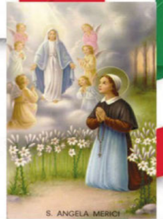
S. ANGELA MERICI