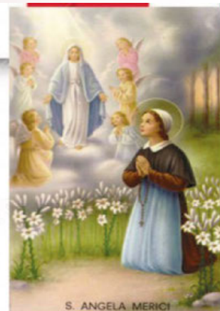
S. ANGELA MERICI