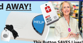
This Button SAVES Lives! As Shown GPS, Lowest Price Guaranteed!