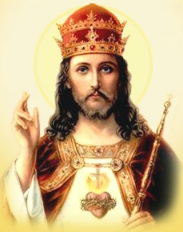
SOLEMNITY OF OUR LORD JESUS CHRIST THE KING

PARISH OFFICE, 838-6565 Parish Fax Number, 838-6566