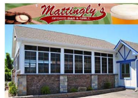
8108 N. Lindbergh - Florissant, MO 314-831-9181 - mattinglysportsbar.com/florissant